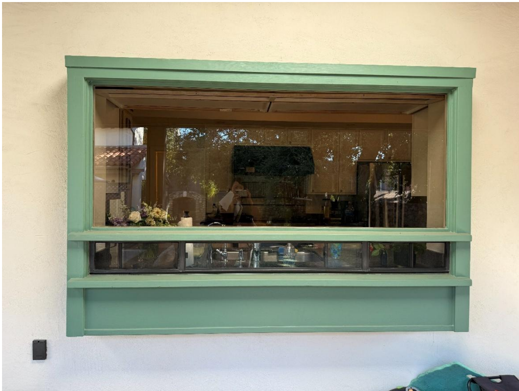
Exterior view of the current kitchen window