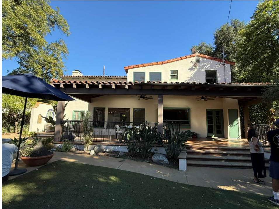
Rear Elevation of the house