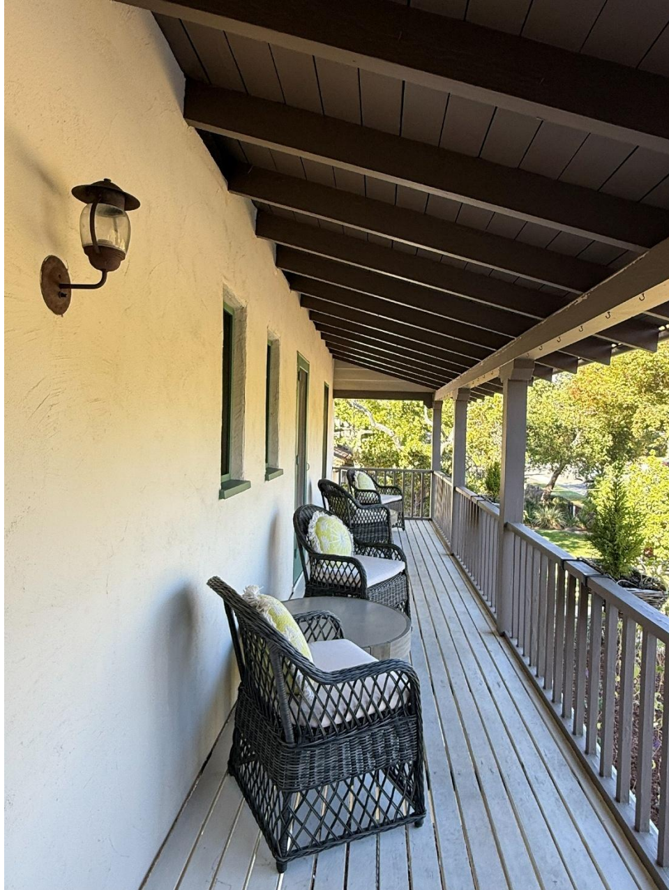
Character-defining Second story balcony facing Indian Hill Boulevard with original light fixture