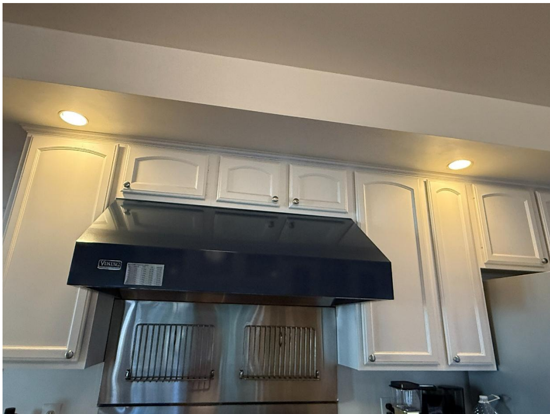
Existing kitchen. Recessed lights to be removed as part of the Ten-Year Work Plan.