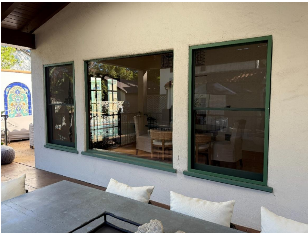
Exterior dinning room windows