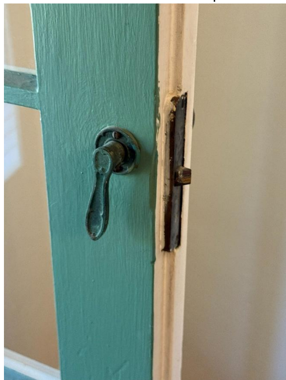
Original doorknobs and hinges exist throughout the house