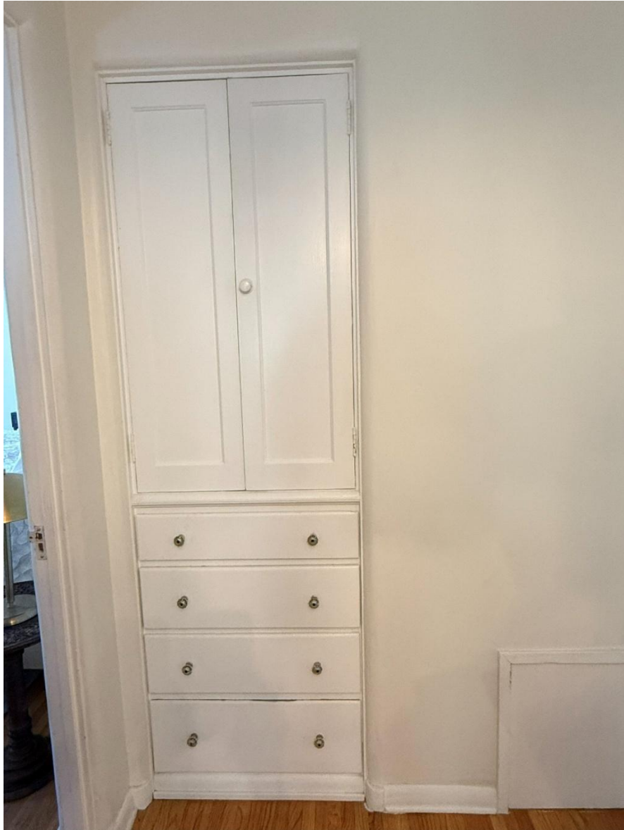
Original built in shelf and drawers