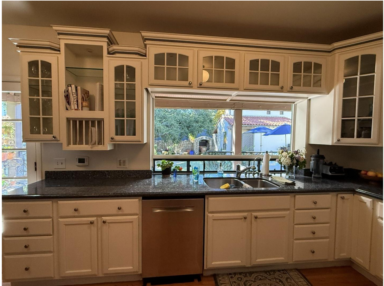
Kitchen cabinets to be replaced