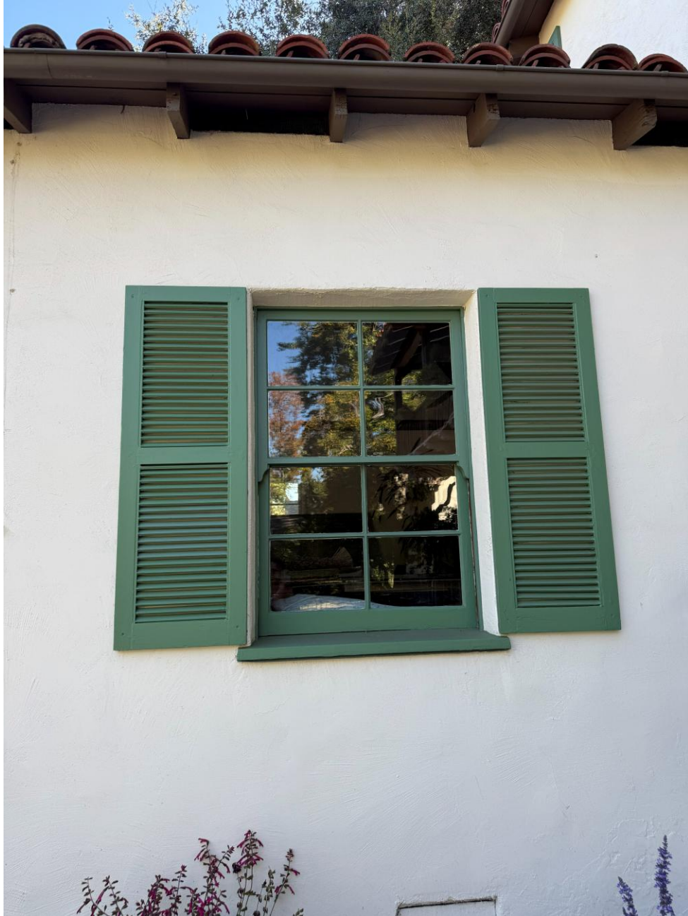
Original wood window and shutters