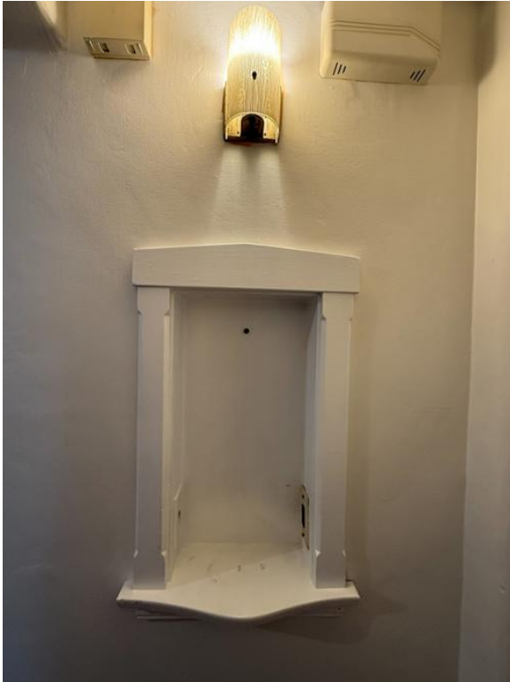
Original phone nook in white plastered wall