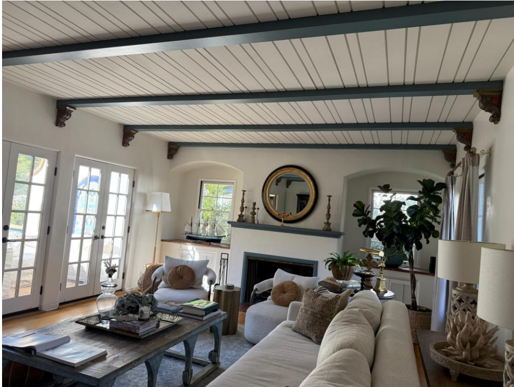
Living room with original features including two windows, ceiling beams, fireplace and flooring.