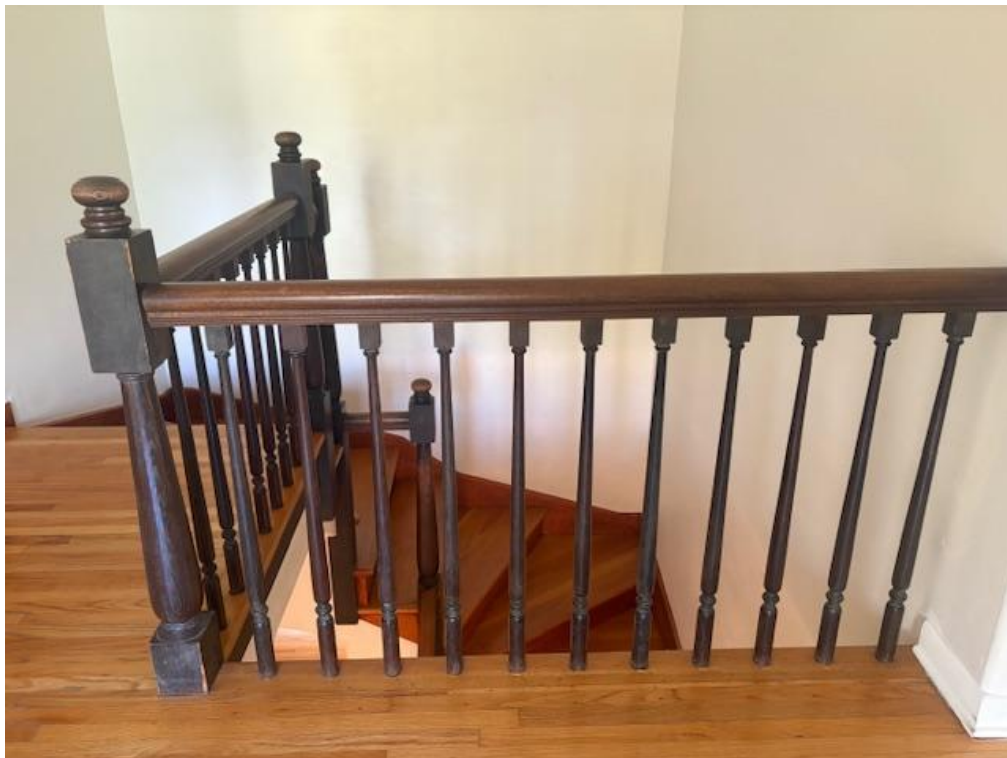
Historic staircase that does not meet current code for height of railing.