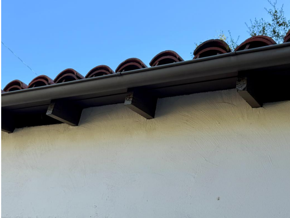
Two-piece clay tile roof. Damage to wooden rafters.