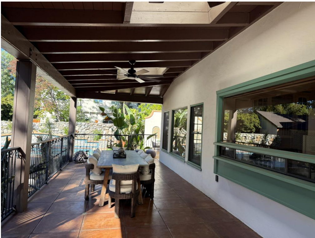
Covered porch in the rear outside the kitchen and dining room.