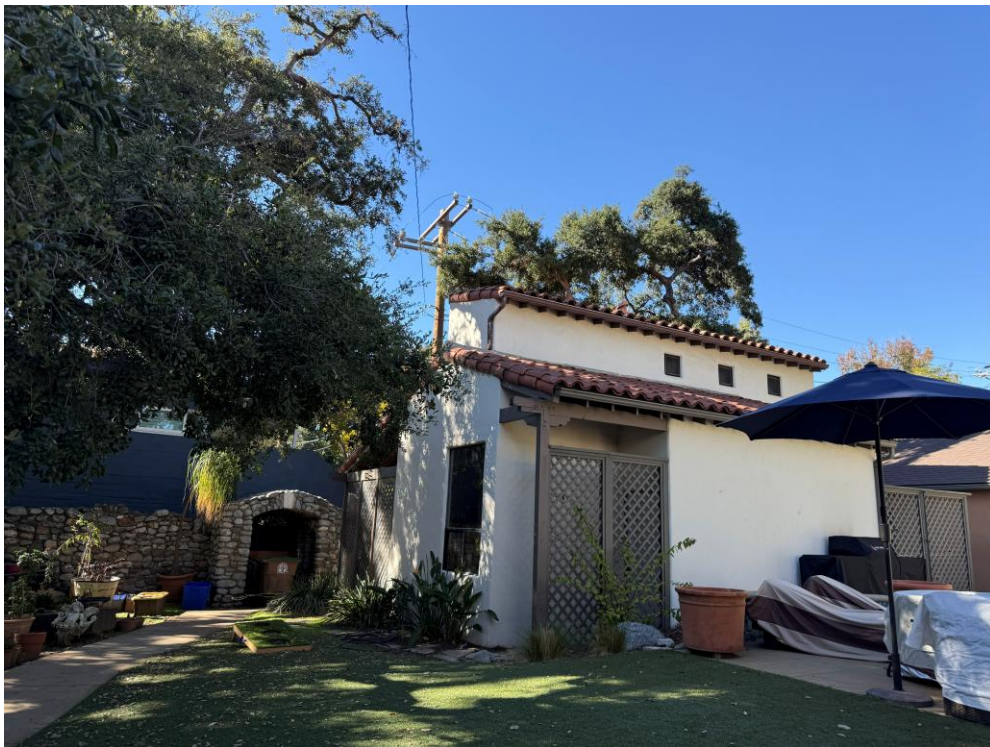
Guesthouse in the rear yard built in 1949