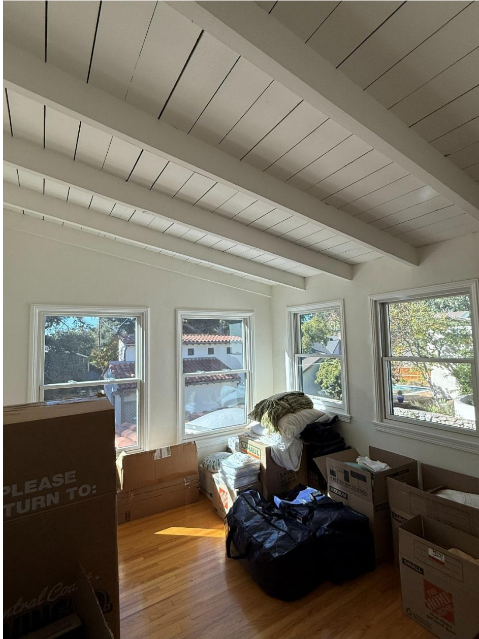
Interior of sun porch which was covered in a previous alteration