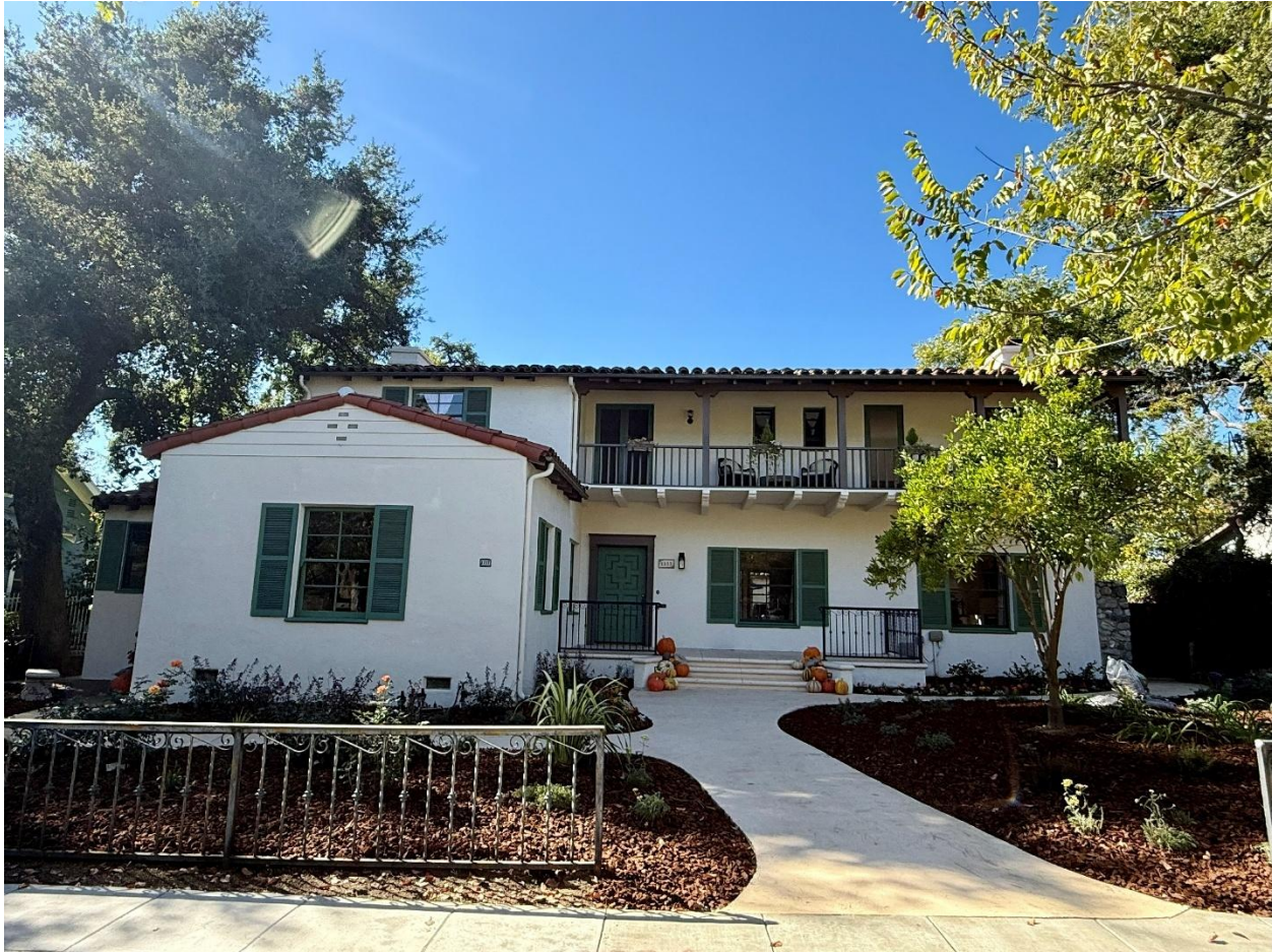
Front elevation of the house facing Indian Hill Boulevard.