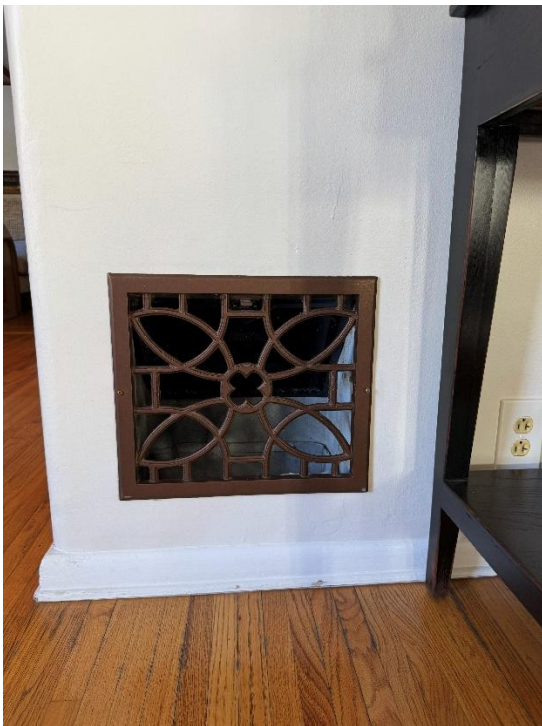
Original air conditioning duck and vent