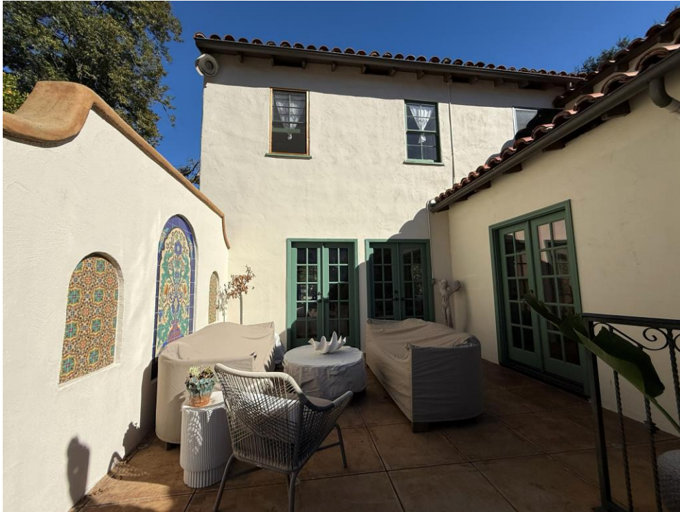
Courtyard. Original doors and windows.