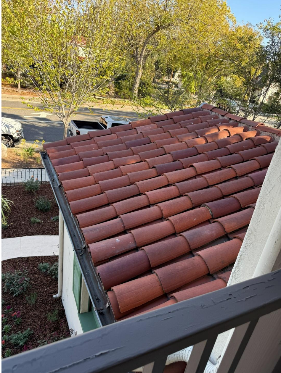
Clay tile roof to be replaced