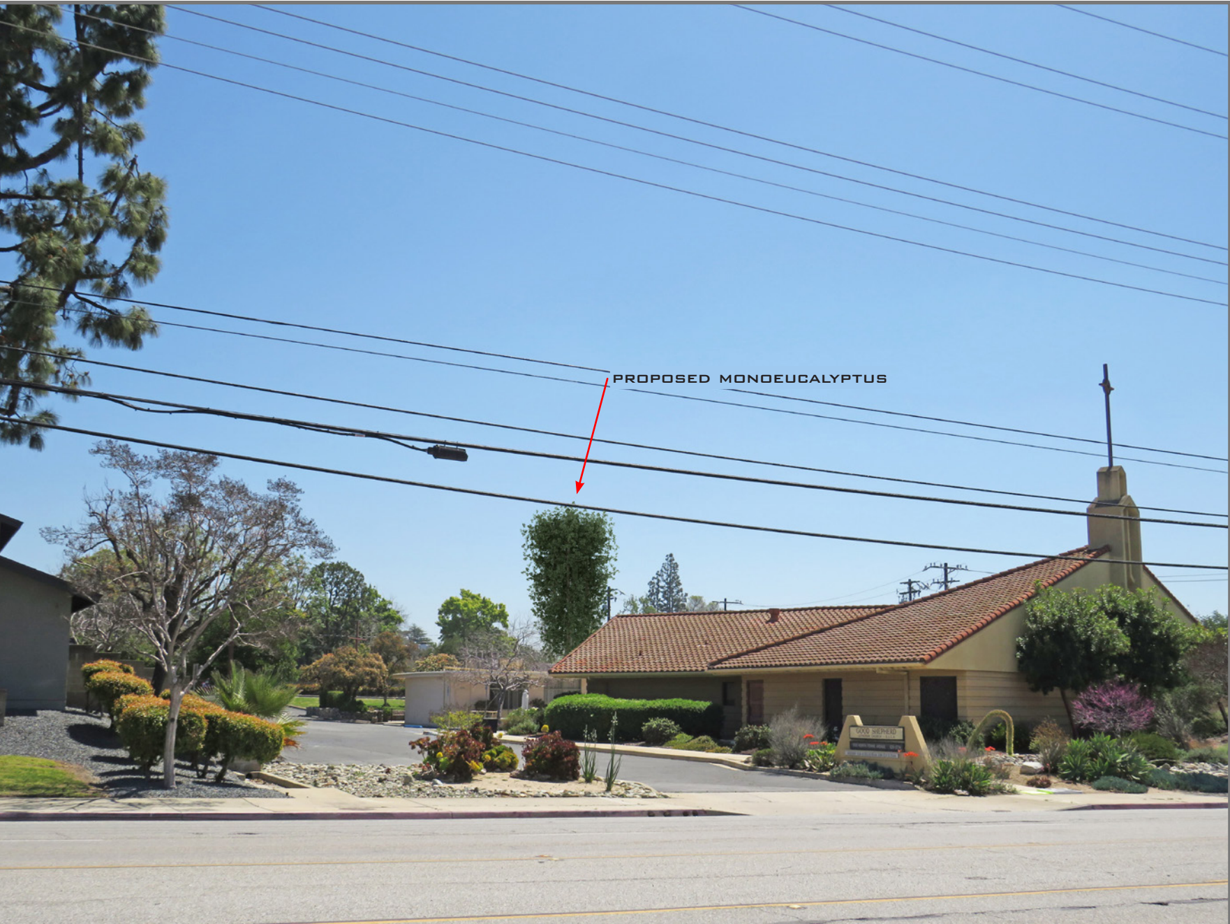
PROPOSED LOOKING SOUTHEAST FROM TOWNE AVENUE