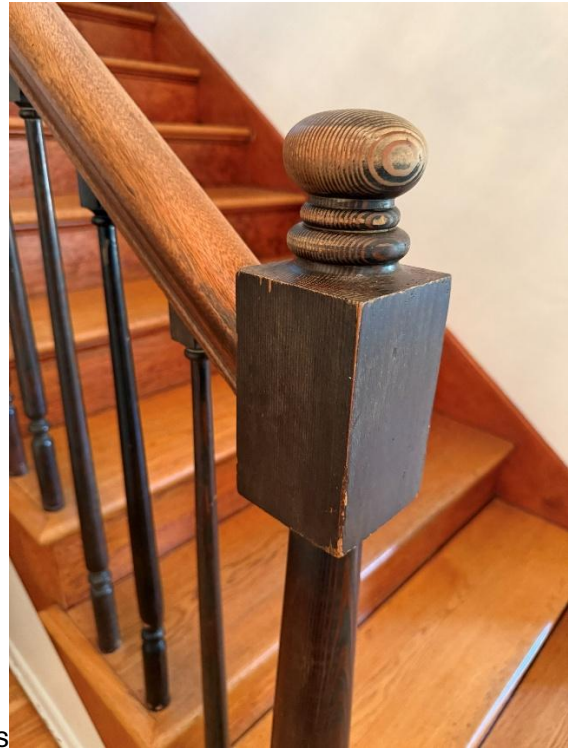
Historic staircase that does not meet current code for height of railing.