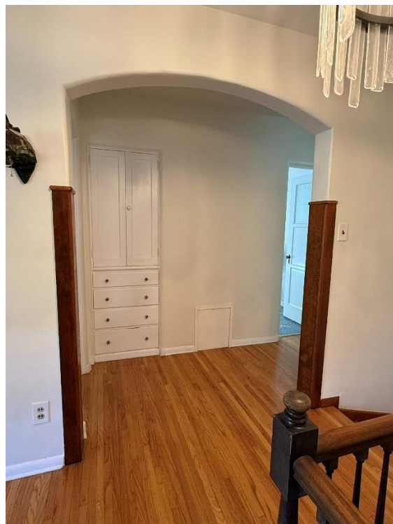
Various arched passageways inside the house.